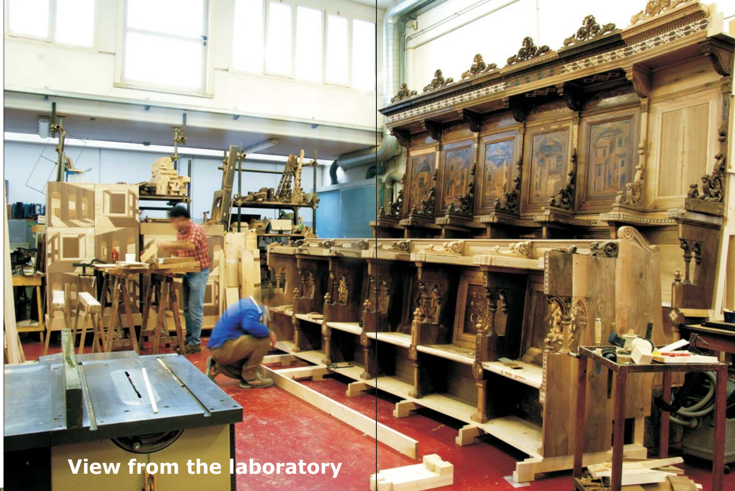
View from the laboratory

Fedeli's Laboratory meet the requirements of the Conservators of Cultural Heritage.