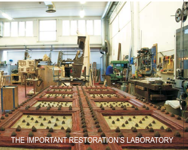
THE IMPORTANT RESTORATION'S LABORATORY

1700 MQ : Wooden materials Restoration zone Pictorial Restoration zone Stone material Restoration zone Parasticide treatment zone Micro chemical Laboratory Offices and storehouses