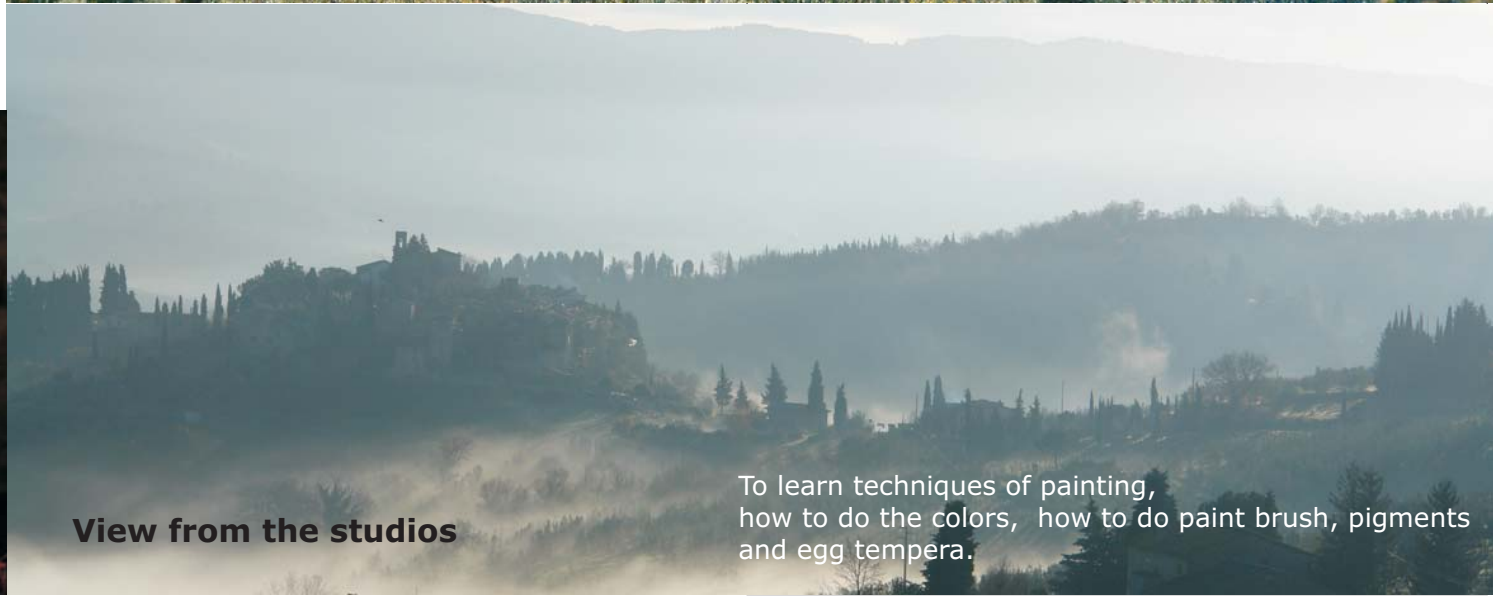
View from the studios

To learn techniques of painting, how to do the colors, how to do paint brush, pigments and egg tempera.