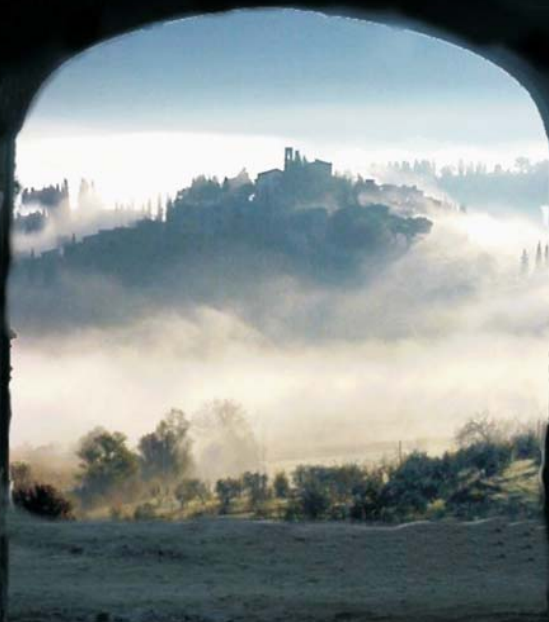
VIEW FROM THE ATELIER

Cost € 150 ( Includes transportation, lessons, refreshments, light lunch and working materials)