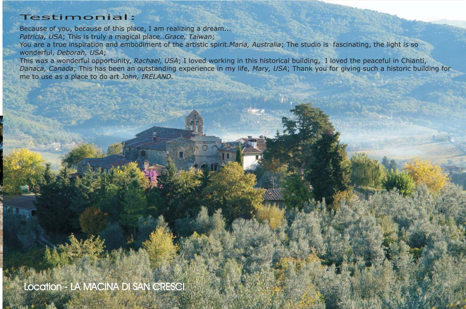
Location - LA MACINA DI SAN CRESCI